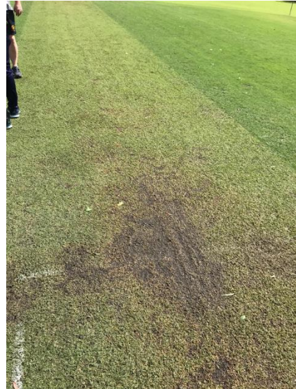
Might do a bit early at Richardson

and there were not many players or ground staff around. As we walked out to the middle we were greeted with the wettest, greenest pitch I have seen.