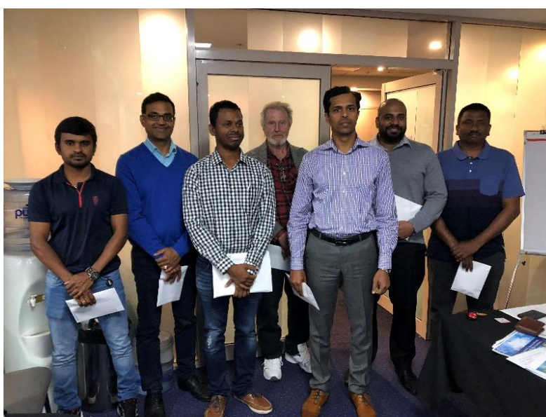
New Members at the October OGM