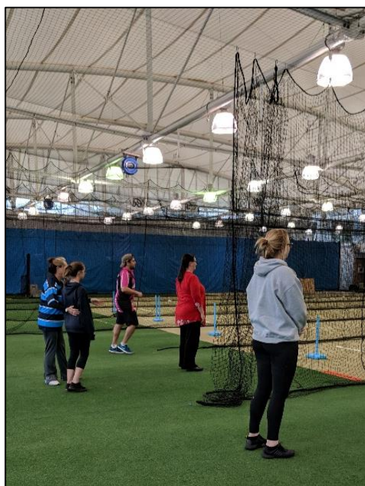
And in the nets too!

The net bowlers were very good at deliberately bowling no balls and wides, not to mention appealing for almost anything to provide the umpires with the opportunity to make decisions and offer explanations as such.