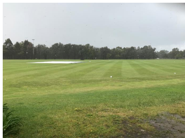
A sorry state of affairs at Breckler Park

Matthew and I inspected the pitch, which was ready for play but the edge of the square had a very wet area that posed a risk to player safety. We delayed the start of play by 30 minutes, which led to a reduction of overs as there is no unaffected playing time in WA Premier Cricket Playing Conditions. As we were about to head out to start play, the rain commenced so the covers had to be re-laid until the rain stopped.