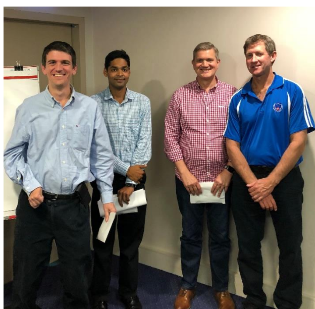
New Members at the November OGM