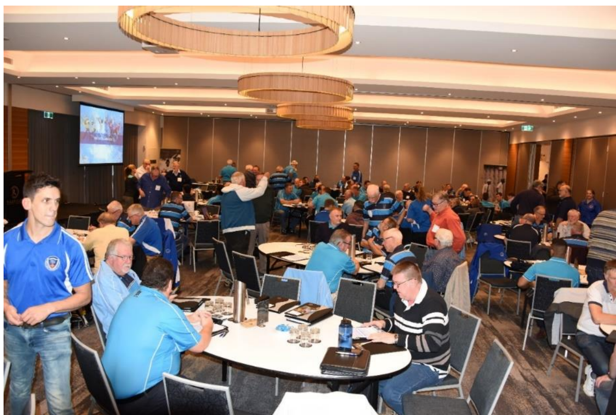
NSWCUSA members in attendance at the 2018 Convention in Wagga Wagga

We would love to see more of our members attend the convention next year. It is most enjoyable and informative and a wonderful way to prepare yourself for the start the new season and to get to know your colleagues better in a relaxed and setting.