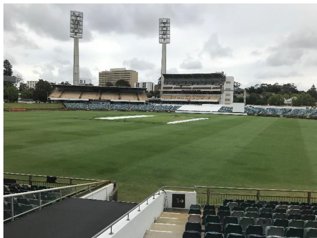
The WACA Ground ahead of a Sheffield Shield fixture