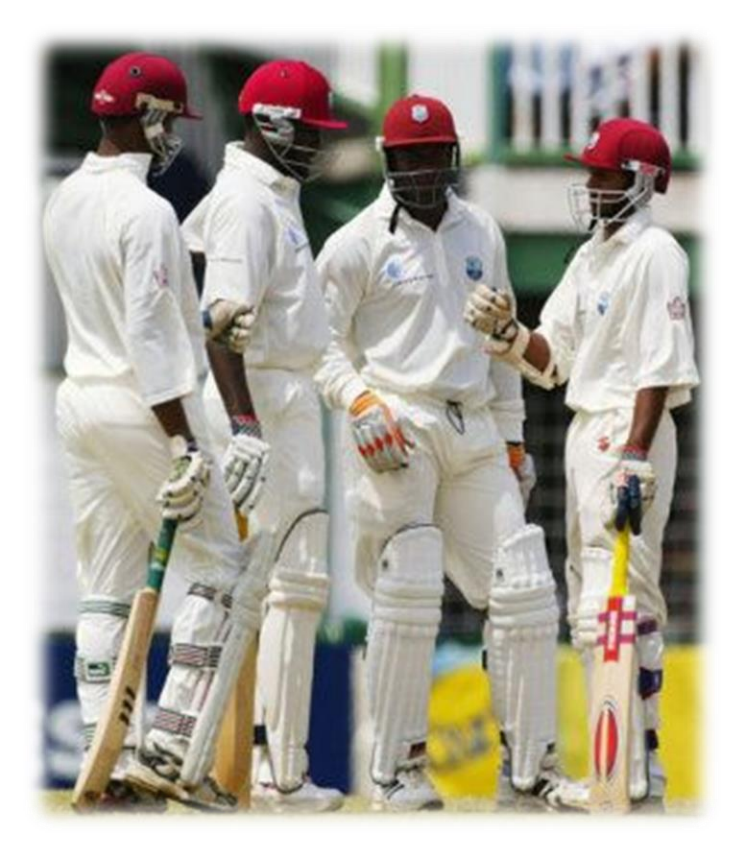
A real test for the umpires!

But, for most of us, it is still woven into the fabric of the game, a part of its history and long may it continue to be with us. What am I talking about? – a match official's favourite scenario – an injured striker with a runner.