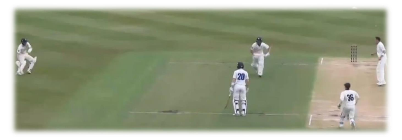
It's not just the umpires who can get confused!

So, when we have a runner appear at the gate during our match, it's no time to shudder in our boots or wipe the nervous bead of sweat from our brows but, an opportunity to demonstrate our knowledge, understanding and ability to apply the law. Slow things down, go at your own pace and, most importantly, help each other out and work as a team to get the job done.