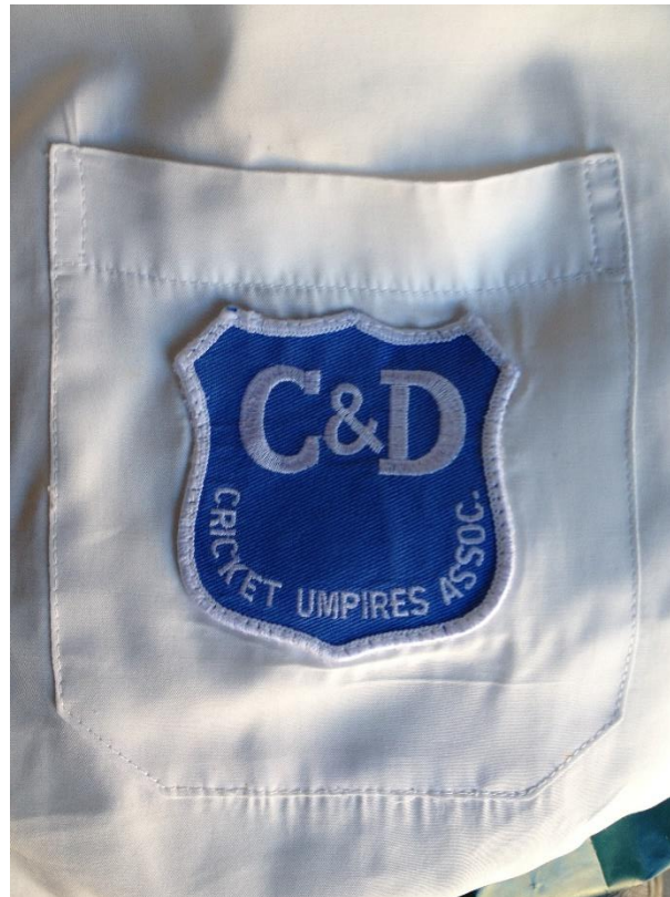
The CDCUA logo as sown onto field gear

There is much research still to do to get a fuller picture of the Association's storied history with some very well-known umpires wearing the black and white throughout the 100 years of the Association operating in Canterbury.