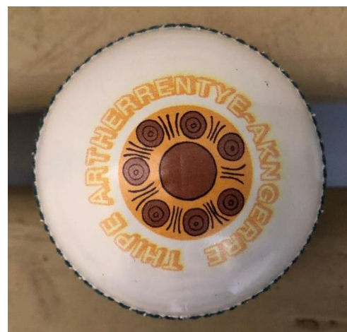
The specially produced NICC ball featuring Arrernte inscription