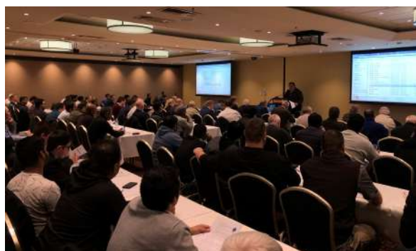
Umpire Training Course Bankstown Sport Club

Thank you to all for supporting the Association's training, education and development initiatives during 2019-20. May all members stay safe, embrace the challenges of the current climate and attempt to turn them into opportunities. We all hope the fast approaching 2020-21 season will be upon us soon, full of training, education and development opportunities and, most of all, plenty of cricket!