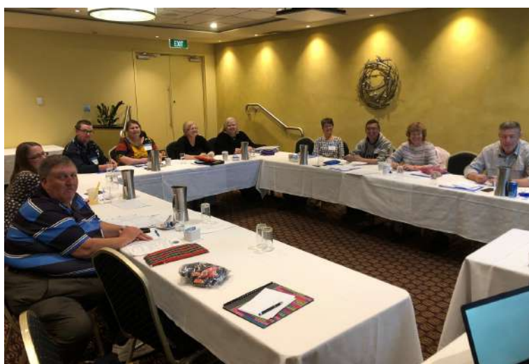
Scorers at the Annual Convention 2019