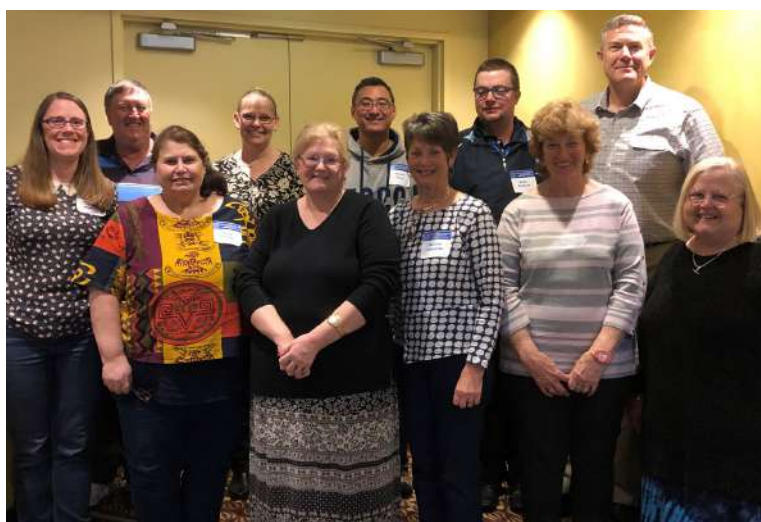
Scorers at the Annual Convention 2019