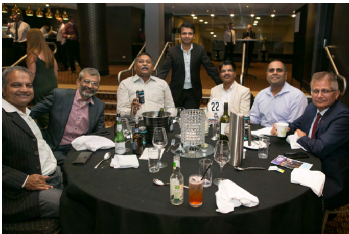
Members at the Annual Dinner