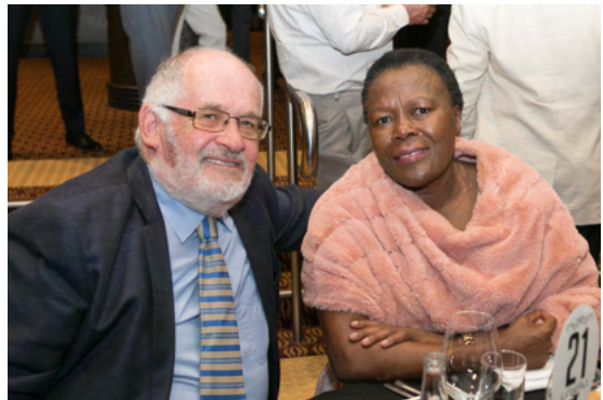
Members and guests at the Annual Dinner