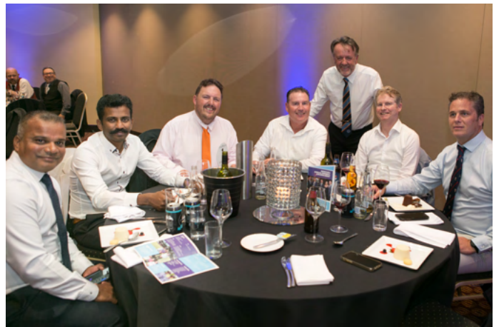
Members at the Annual Dinner