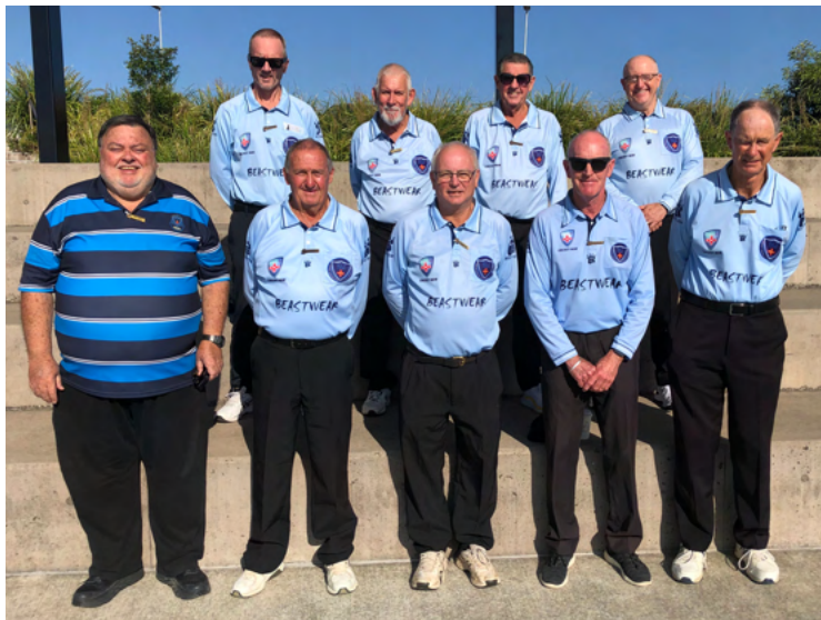
Umpires and Match Referee for the Bradman Cup