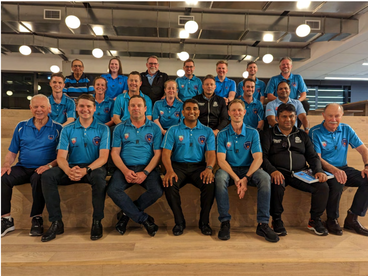
ICC Men's T20 Umpires attend a session at Cricket Central

The female umpires in NSW are supported greatly by every partner they stand with and the associations that appointment them to matches. Thank you to all who support the endeavours of the female umpires around the state.