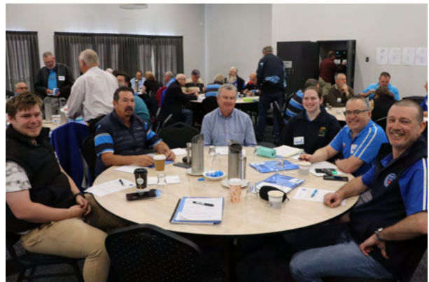
Members at the Annual Convention